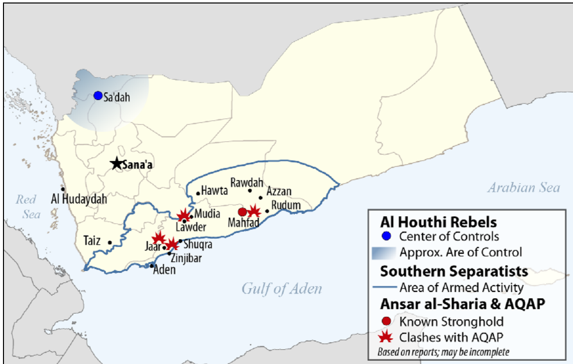
Figure 3. Map of Yemen Locations of Northern and Southern Rebellions and AQAP Presence